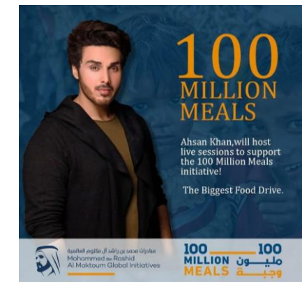
100 million meal drive