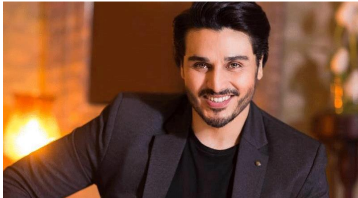
Goodwill ambassador for Children's Literature Festival