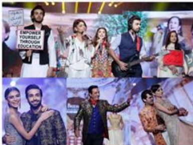
Bushra Ansari, Ahsan Khan, Urwa Hocane and Farhan Saeed held placards to raise awareness about child abuse.