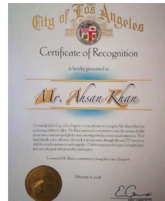
Certificate of recognition for promoting children's right