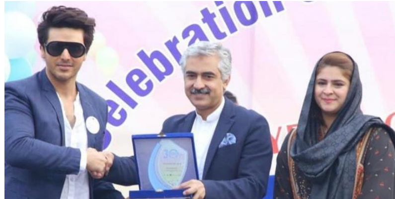
Punjab Government Child Protection and Welfare Bureau Ambassador