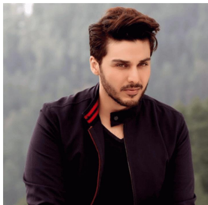
Brand ambassador for Human Development Foundation