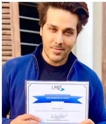
LRBT Ambassador of Sight