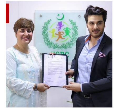
Fundraiser organized by the Human Development Foundation in Los Angeles, California Goodwill Ambassador for Children's rights in Pakistan