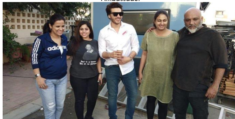
Ambassador To Promote Sanitation In The UAE