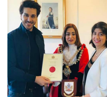
UK Goodwill Ambassador to Pakistan