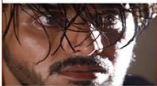
Ahsan Khan in Udaari

Written by: Syed Abbas Hussain Posted on: October 03, 2016